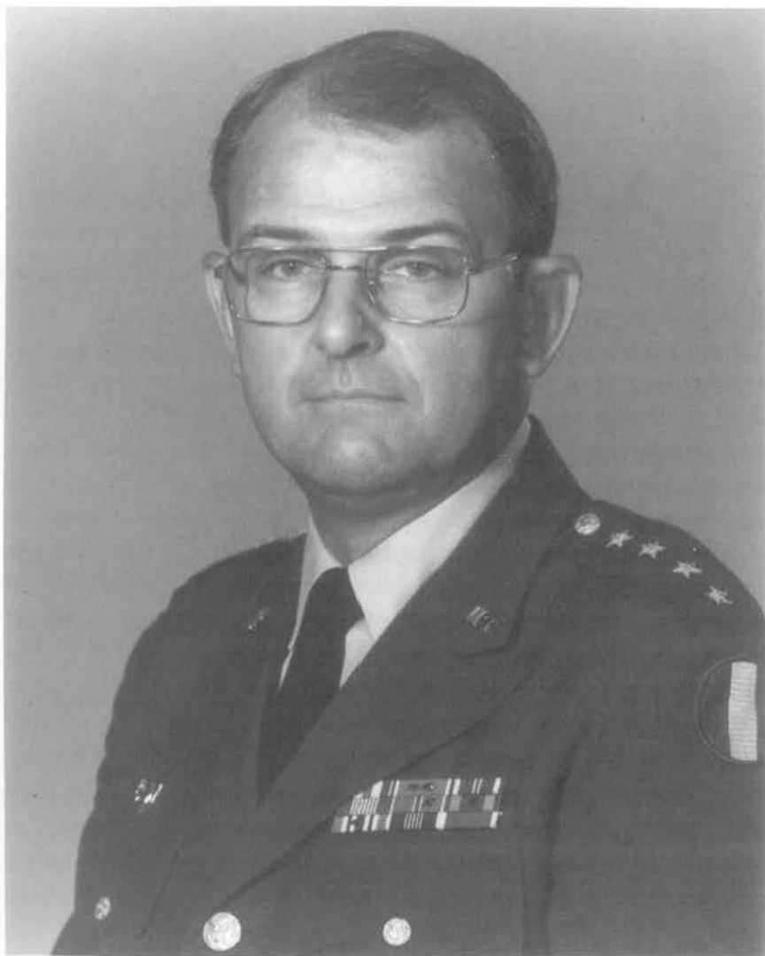
General Donn A. Starry Commanding General United States Army Training and Doctrine Command 1 July 1977 — 31 July 1981