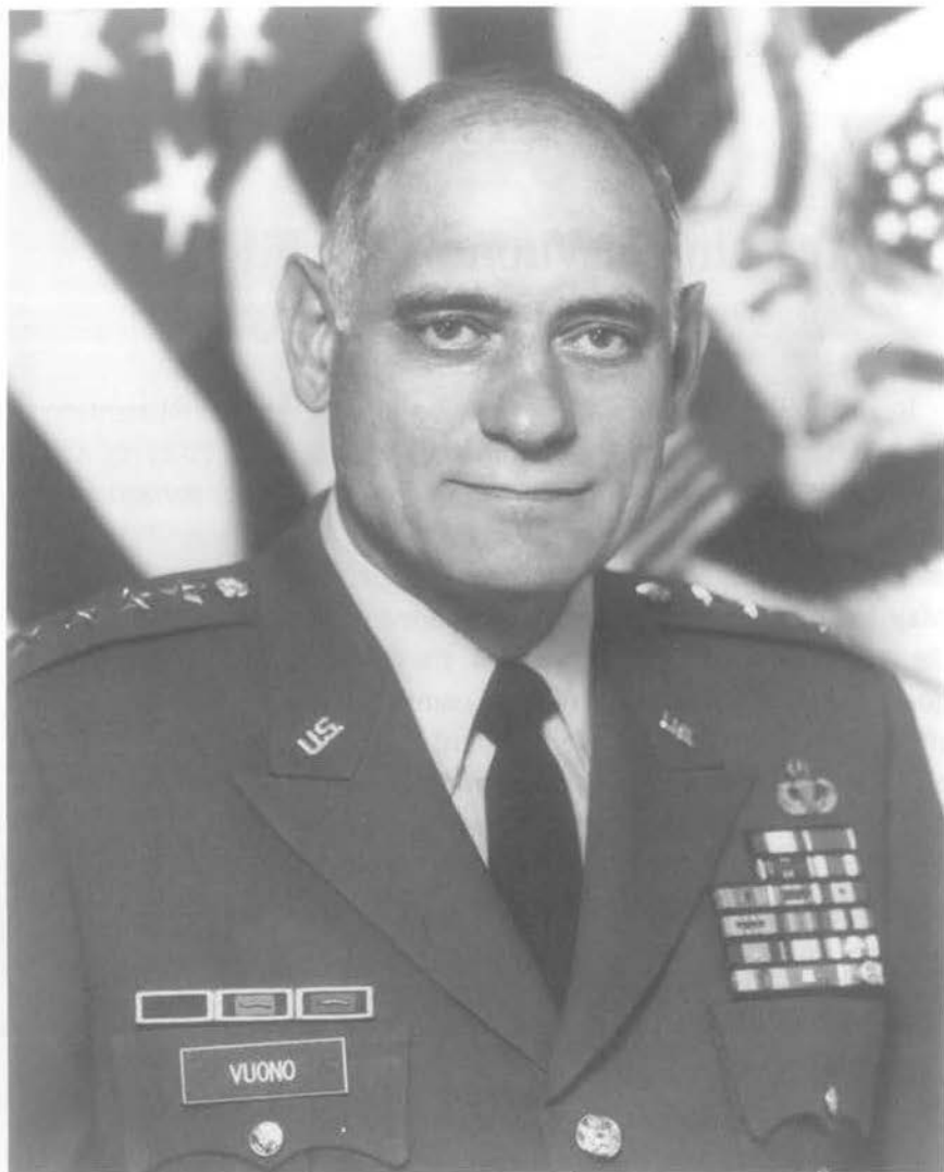
General Carl E. Vuono Commanding General United States Army Training and Doctrine Command 30 June 1986 — 12 June 1987