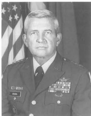
LTG Charles W. Bagnal