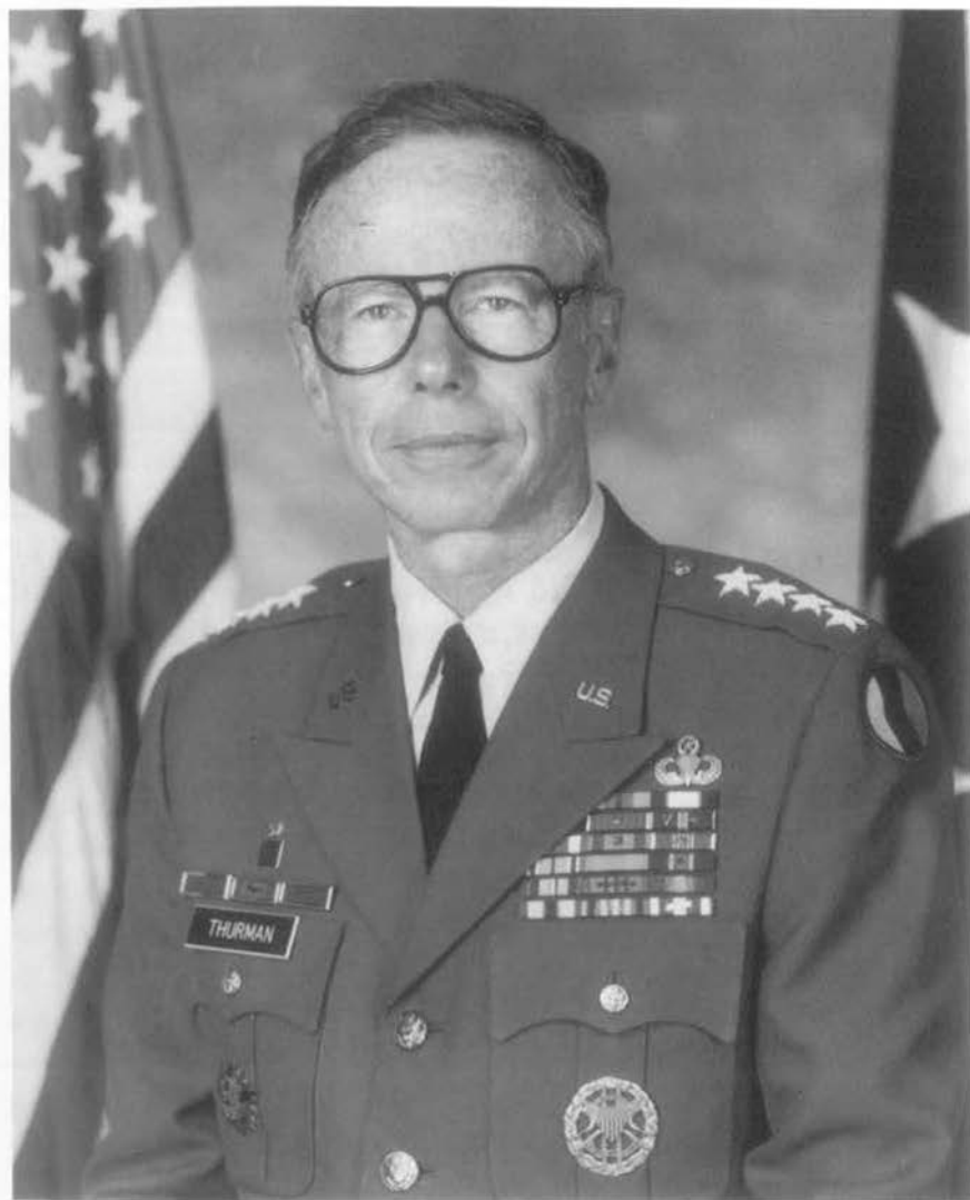
General Maxwell R. Thurman Commanding General United States Army Training and Doctrine Command 29 June 1987 — 1 August 1989