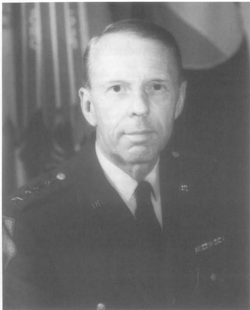
General William E. DePuy Commanding General United States Army Training and Doctrine Command 1 July 1973 — 30 June 1977