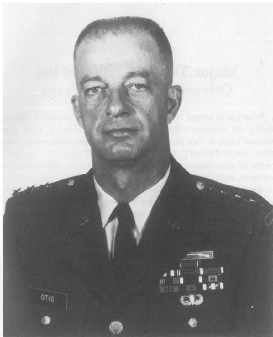
General Glenn K. Otis Commanding General United States Army Training and Doctrine Command 1 August 1981 — 10 March 1983